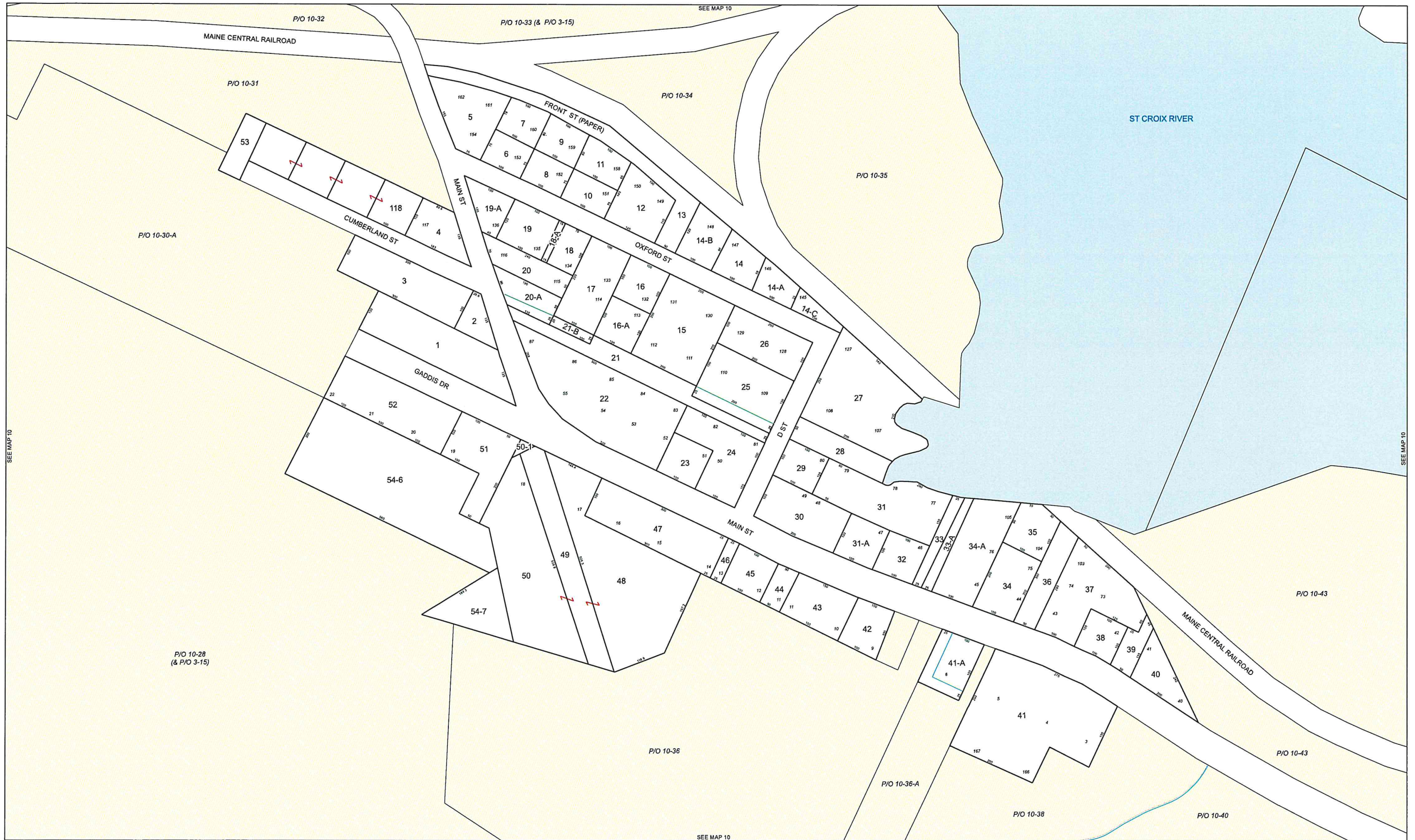
Map prepared by LatLong Logic, LLC for the Town of Baileyville (October 2018).